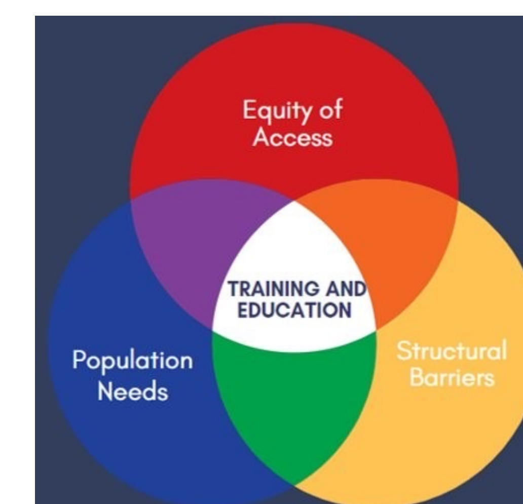
Figure 4: Summary of Themes in Mental Health Community Testimonies. Cross-referenced with the qualitative framework approach, the NLP results identified 4 primary themes: (1) structural barriers, (2) equity of access, (3) population-specific needs, and (4) training and education gaps.